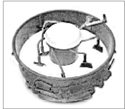
Stetter turbo pan mixer

The Stetter CP 30 batching plant has been well received in the market and is currently being used extensively at various