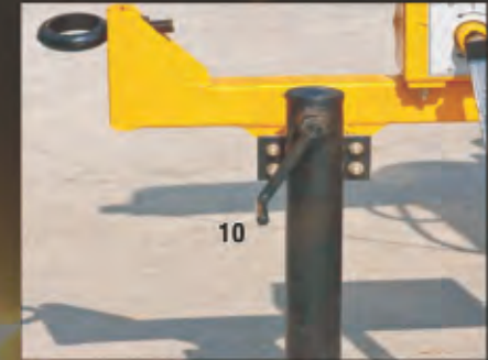
10. Side support legs with adjustable height & inbuilt operating handle.