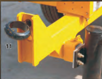
11. Height adjustable toeing-hook suitable for pick up vehicles.