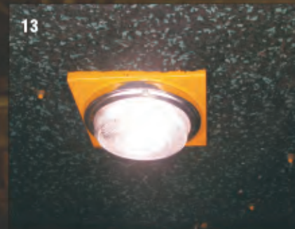
13. Cabin-Light for night working