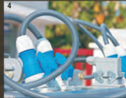
4. IP-54, easy plug in-plug out socket's for light fittings, with UV protected conduits on the wires for long life.