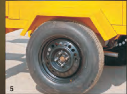
5. CEAT/Birla branded tyres