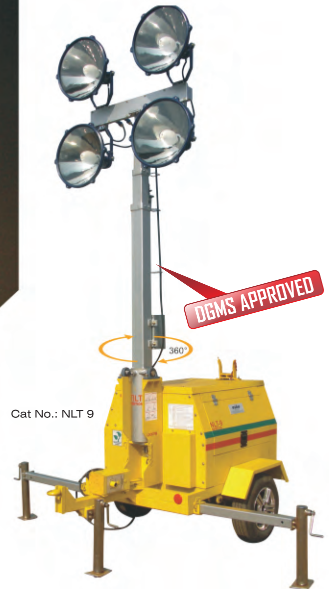
Cat No.: NLT 9