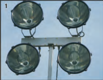
1. Four Stainless Steel Flood light's with 550 mm diameter and with pilfer proof bolting.