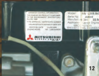
12. Mitsubishi Heavy Industries (India) 2 Cylinder Diesel Engine