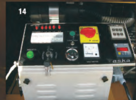
14. Single Control Panel with ESU, Hour meter, Fuel meter, Heater switch, cabin light, Individual MCB for light Control.