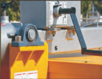
6. Rugged-column post for 4 tower sections, with telescopic winch.