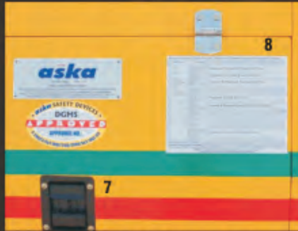
7. Lockable doors for remote areas. 8. Preventive maintenance schedule for operators.