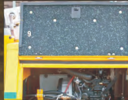
9. Engineered Acoustic foam with 140 kg/m 3 density which is dust & fibre free for dusty site conditions for longest durability & life. It does not catches fire.