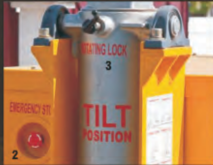
2. Emergency stop push button on enclosure in case of immediate switch off the light tower. 3. 360 degree rotation in erected position, with rotating lock.